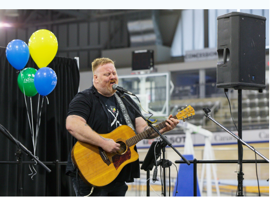
Live entertainment during lunch