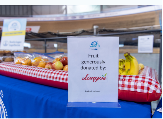
Snacks to fuel participants!