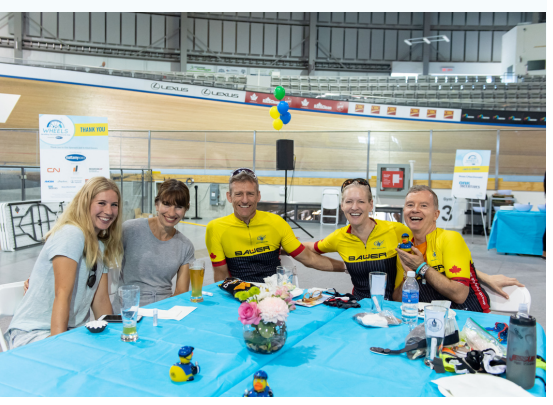
Celebrating together after the ride

*Size and location of logo recognition on posters, advertisements and signage will be based on the sponsorship level. Recognition opportunities may be subject to content and print deadlines.