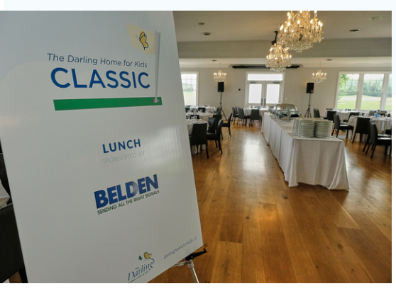
Golfers enjoy a fabulous meal after their round