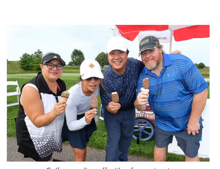
Golfers cooling off with a frozen treat

As the population of medically complex children rises in Ontario year over year, so does the demand for our services. When you support the DHK Classic, you help us move one step closer to our goal of a world where no child is too complex to receive the love, care and support they deserve.