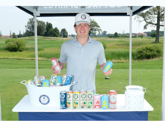
Cottage Springs on course to provide beverages for golfers