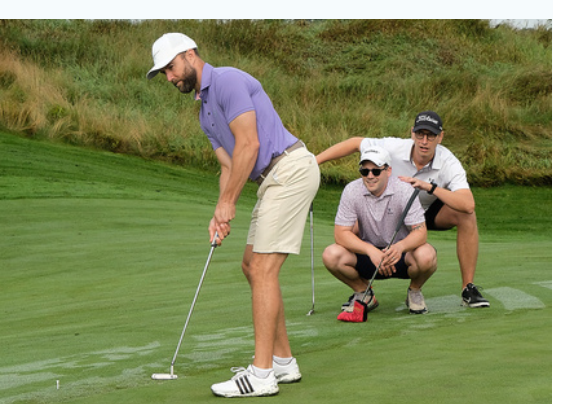
Lining up the perfect putt.