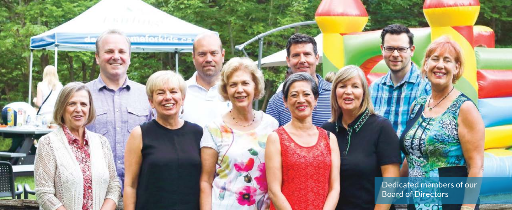
Dedicated members of our Board of Directors