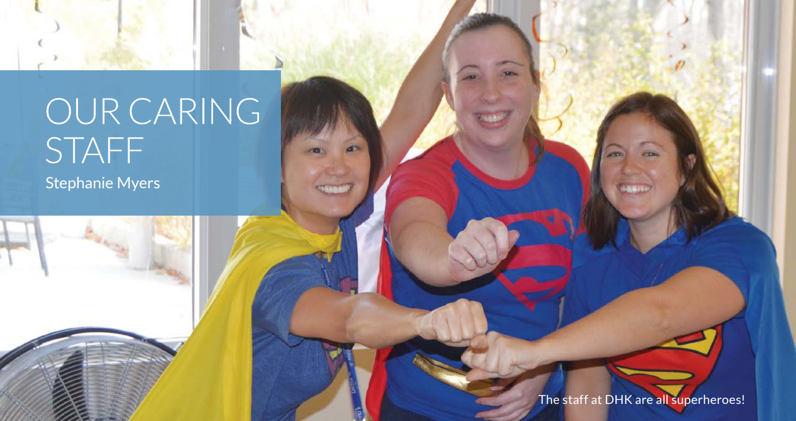
The staff at DHK are all superheroes!