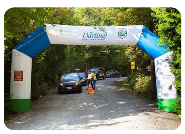
*Checkpoint location to be determined by route organizers