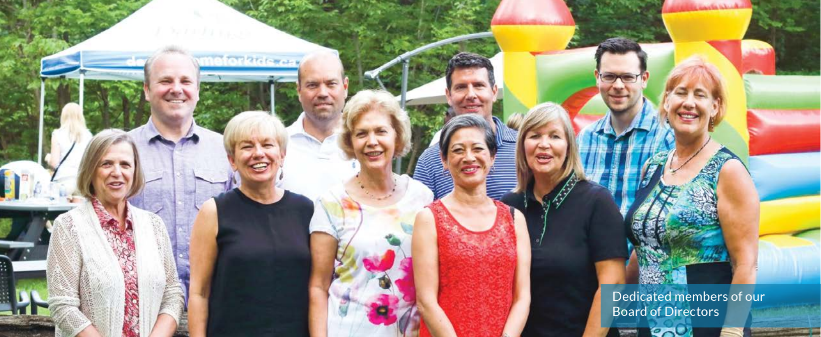
Dedicated members of our Board of Directors